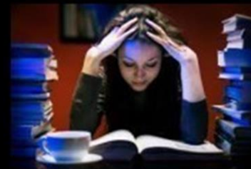
What I actually do.