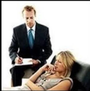
What my friends think I do.