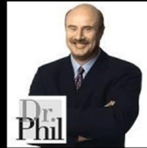
What society thinks I do.