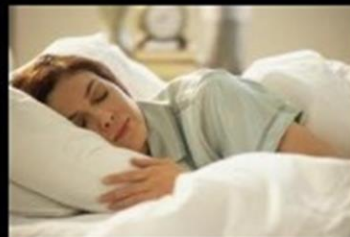
What I never do.