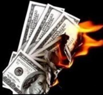
What my parent think I do.