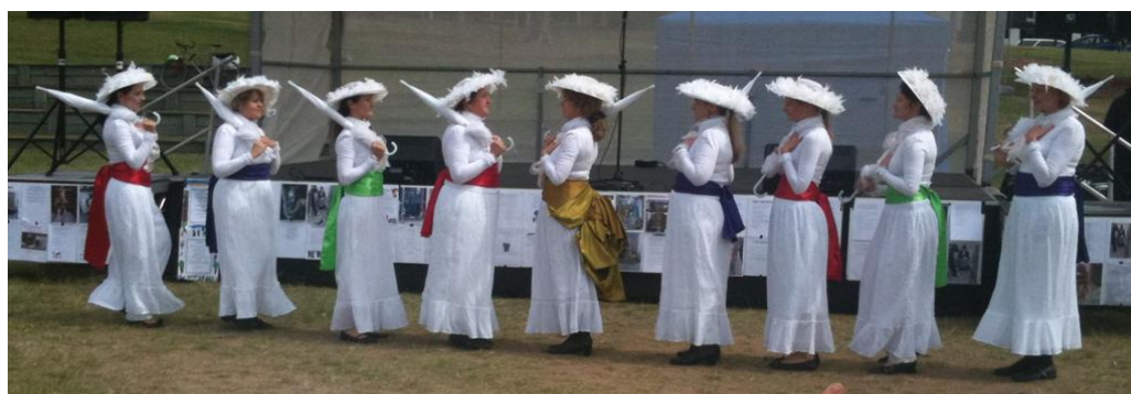
Above: Women's International League for Peace and Freedom perform at the International Day of Peace in Brisbane, Sept 21, 2010.