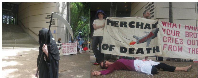
Above: Peace advocates put on a dramatic display and outside the November 2010 Land Warfare Conference in Brisbane attended by some of the world's biggest arms manufacturers including Boeing, Lockheed Martin, General Dynamics, British Aerospace, Raytheon and KBR (Halliburton).