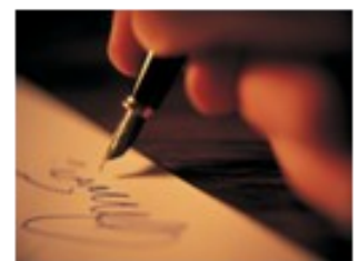
Members may contribute articles and papers to the newsletter.