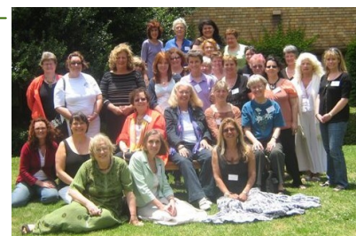
Participants from 19th W&P Conference in Sydney, NSW—This could be you in at this year's conference! Join us in December 2009 for the 20th!