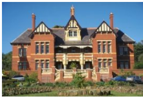
Heritage-listed Sunbury Campus of Victoria University, will be the site for the 2009 W&P 20th Annual Conference.

4, 5 & 6 December 2009 Sunbury, Victoria