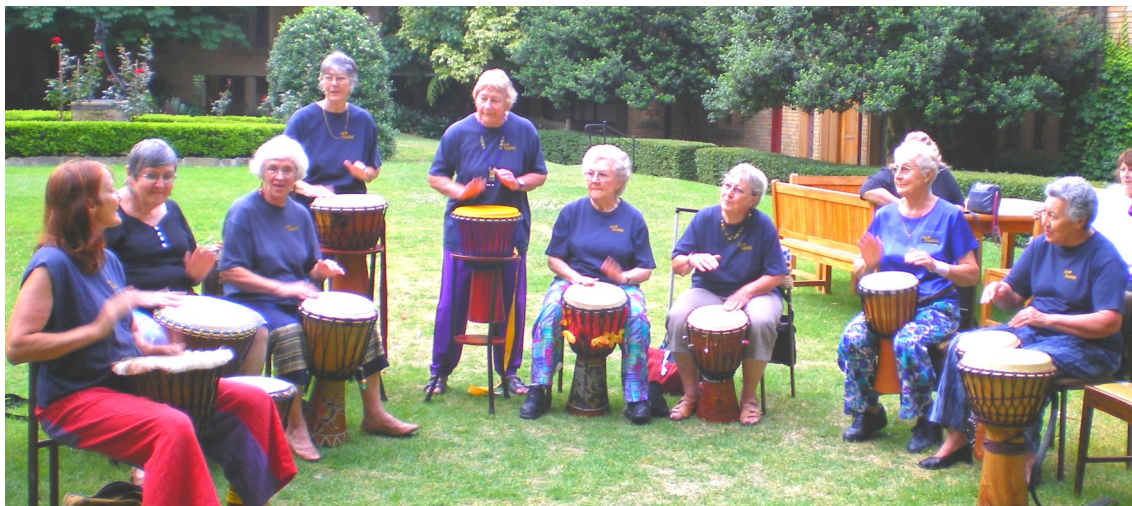
The Jam Tarts from Older Women's Network, Bankstown performing at the 19th Women and Psychology Conference

WE WANT YOUR PICTURES OF FEMINISTS. SEND THEM TO: DORI.W@BIGPOND.COM