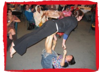
Women training to perform at Women's Circus